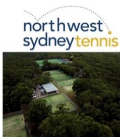
Strategic Plan 2024-2028

It has been noted that some players, members and social players , sometimes take advantage of arriving early and access courts at both Pennant Hills and Epping up to half an hour earlier or stay later and prop court doors open to enable longer access. Please be fair and do the right thing.